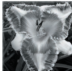
H. “Highway Blues”